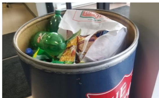
SALVATION ARMY FOOD DRIVE